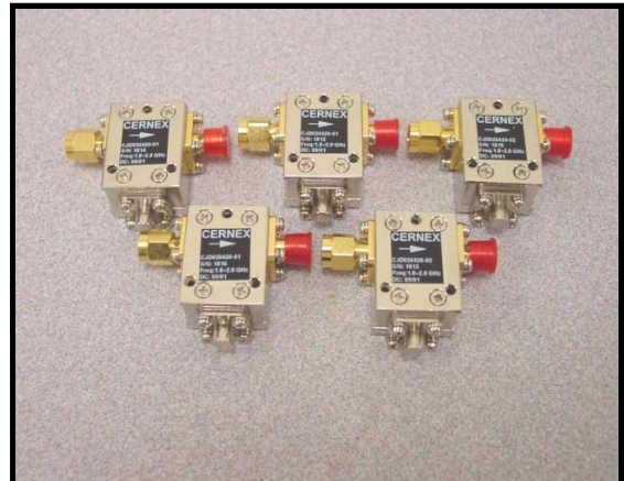
COI & COC Series